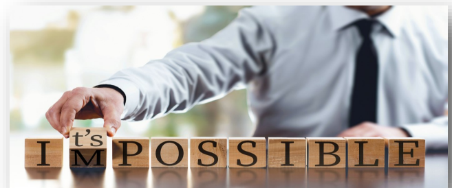
Making Cybersecurity Possible