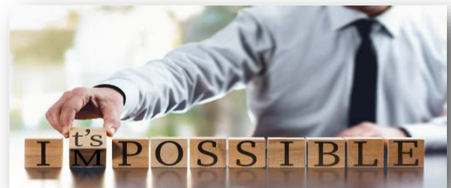
Making Cybersecurity Possible